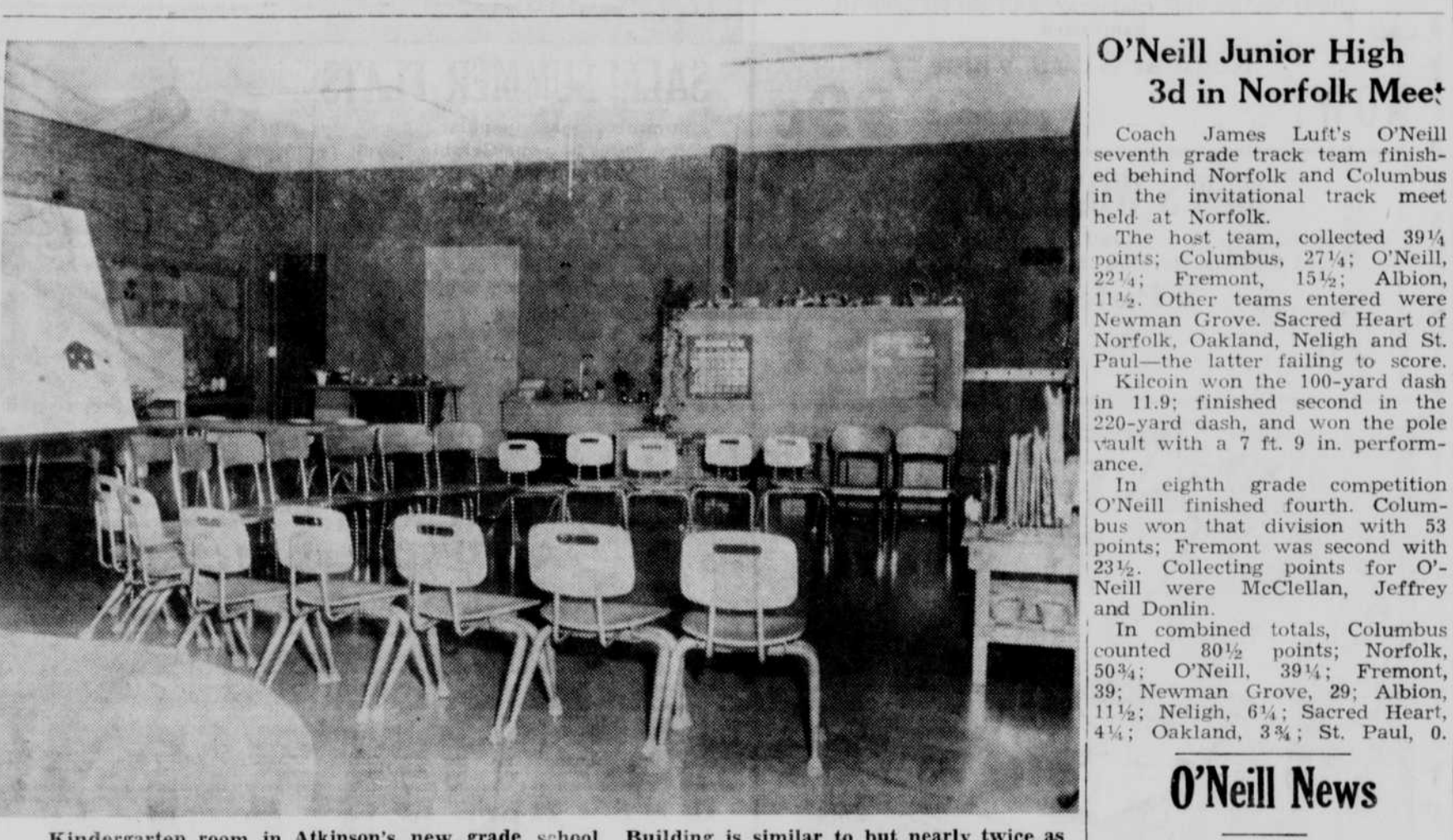
Kindergarten room in Atkinson's new grade school. Building is similar to but nearly twice as big as O'Neill's new school.