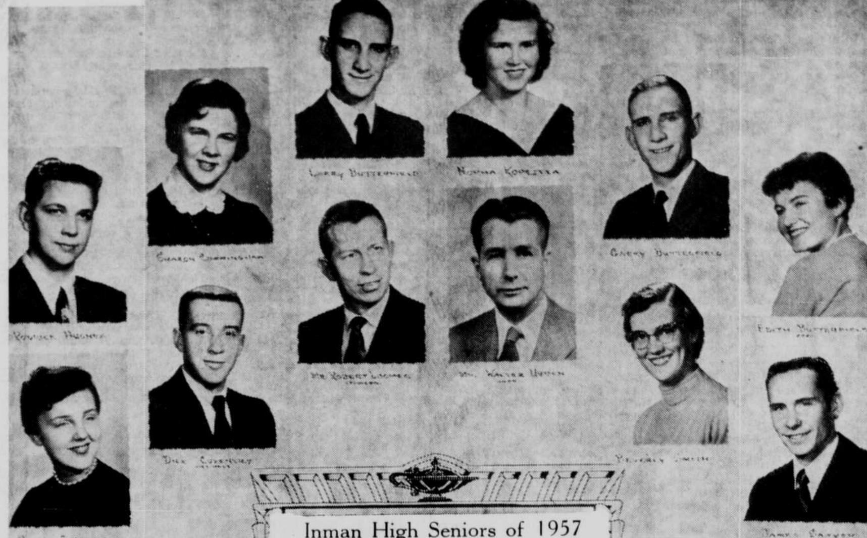
Inman High Seniors of 1957