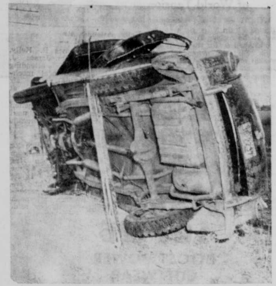
Three Ewing youths late Monday won a speed race with ONeill police but nearly lost their lives. Car was driven by Delbert Carl, jr., 17, of Ewing. (Story below.)