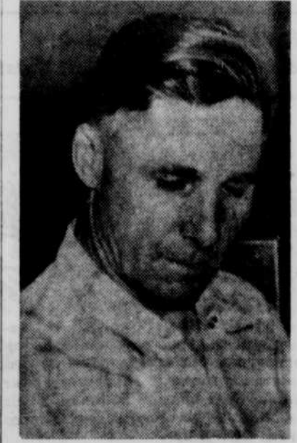
Plugge . . . the father.

NEWS, PICTURES OMITTED Considerable news matter and cause of a later volume of adver-But something went awry. The tising.—Publishers.