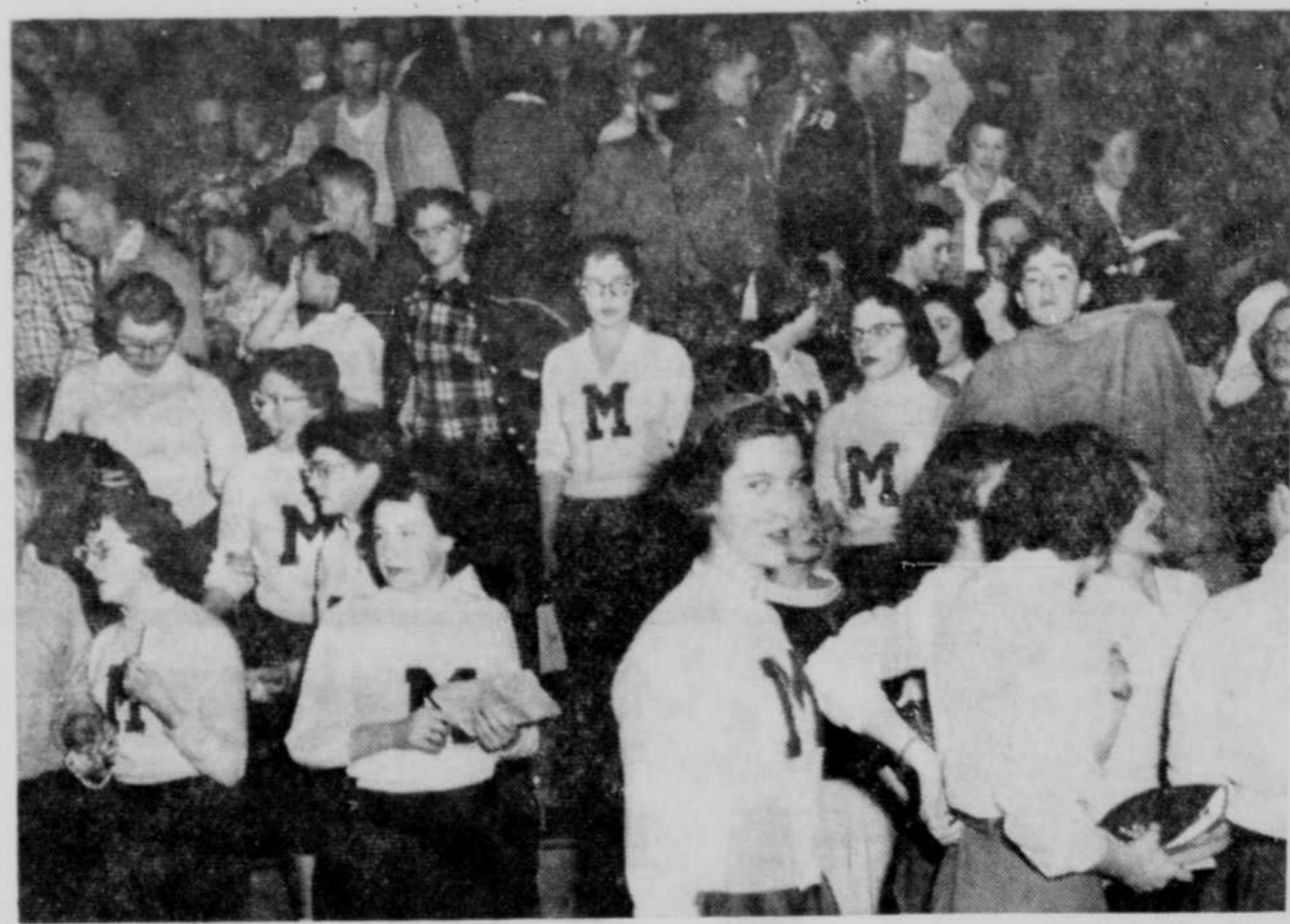
Gloom pervades the St. Mary's cheering section and there was some weeping following Thursday's heartbreaking, one-point-loss to Cedar Rapids in the class C cage playoffs.