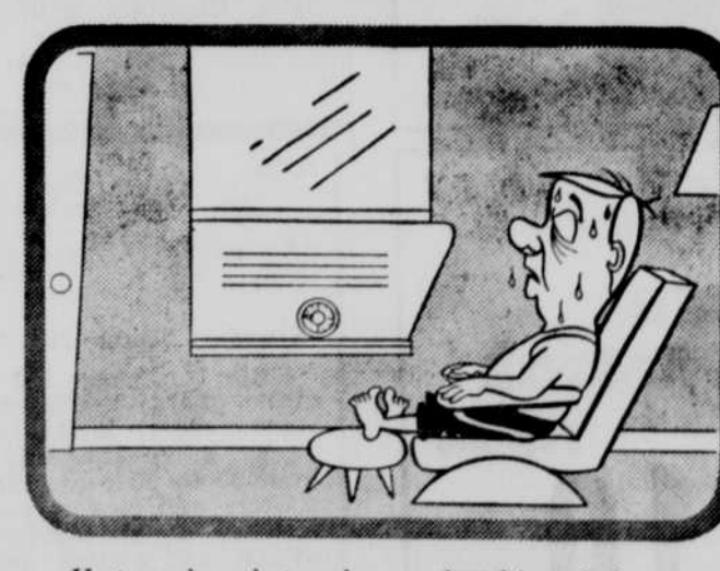
He turned on that cooler . . . relaxed in a chair . . . But he waited in vain for some nice, clean, cool air.