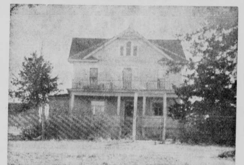
Front view of modern, nine-room dwelling (camera looking south).

MANY, MANY OTHER ARTICLES TOO NUMEROUS TO MENTION