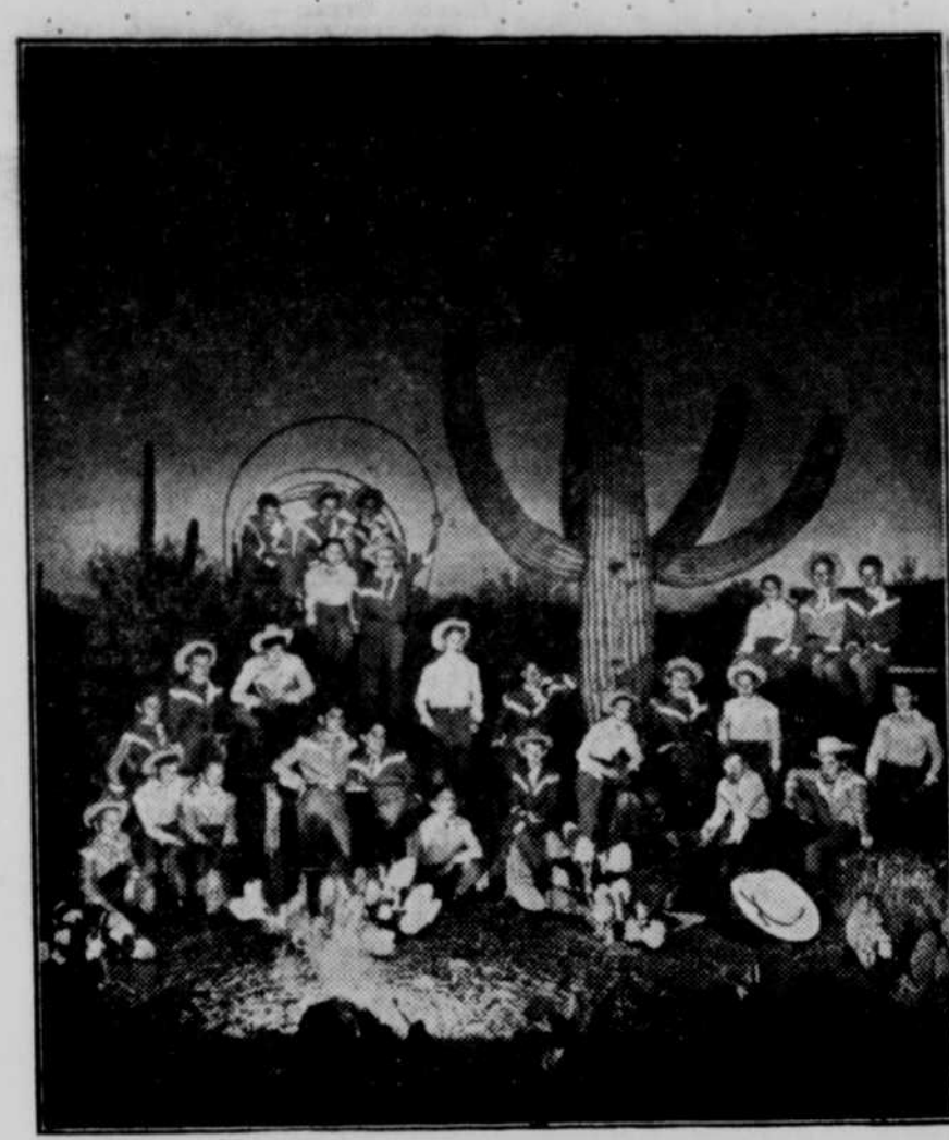
Tucson Boys' Chorus and authentic Southwestern stage settings . . . varied program designed to please everybody