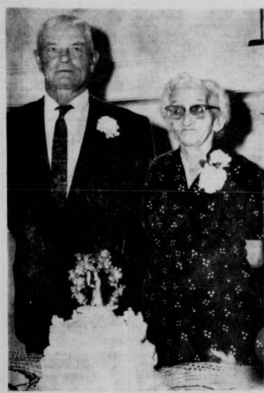
The Clydes . . . both enjoy good health.