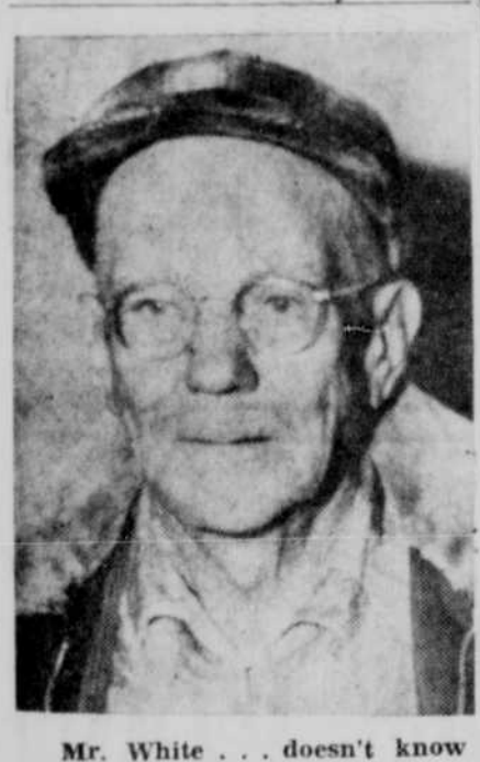
how he'll react to leisure .

The baby must be born within he confines of Holt county, and