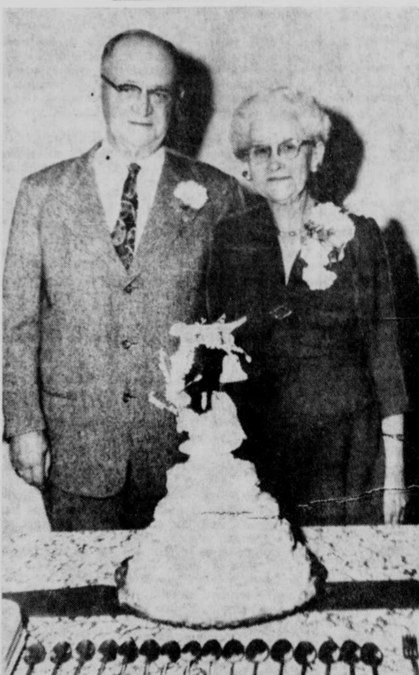
The Tams... lived in seven communities.

A free show will be shown for the children Saturday afternoon, December 22, at 1:30 o'clock, sponsored by the Commercial club.