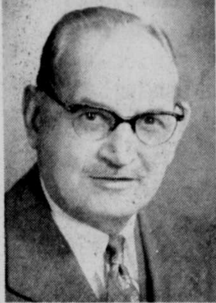
Stannard... elected from field of 900 insurance representatives.