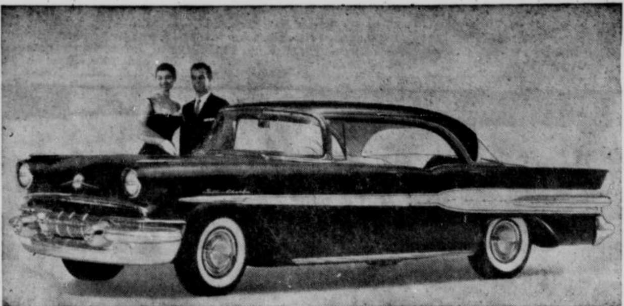
Pontiac Custom Catalina sedan... the 1957's go on display Friday at the Wm. Krotter Co. showrooms at O'Neill and Spencer.