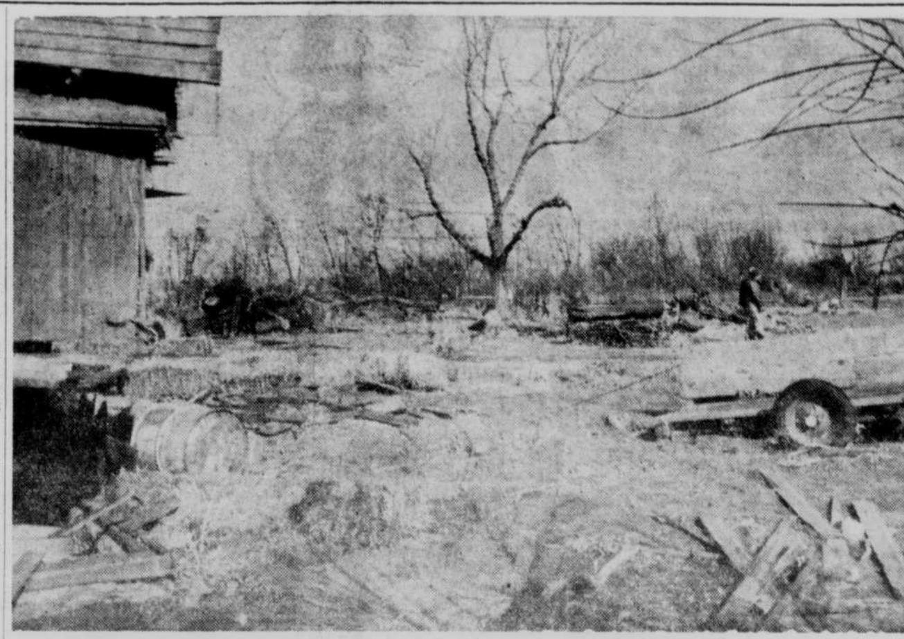
This is a northeasterly view at the Carl Michael's farm in the wake of Monday's tornado. Barn and dwelling were damaged .- The Frontier Photo.