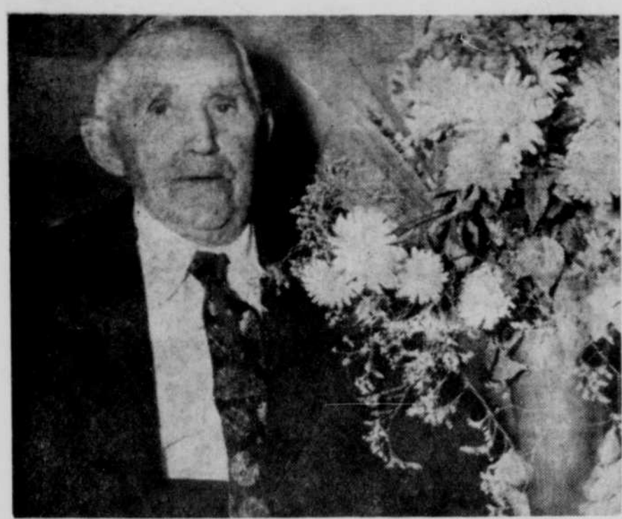
he was called upon to make a speech .-