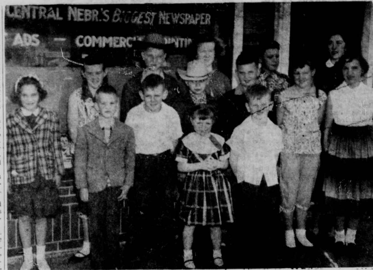
Students on Educational Tour

The teacher and pupils from Holt county rural school district 5 made an educational tour of O'Neill on Wednesday, May 9, including a visit at The Frontier printing and publishing plant and "Voice of The Frontier" radio studios. The school is situated in the Elkhorn river valley 2 1/2