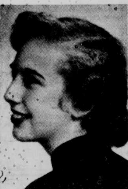
To Wed in June