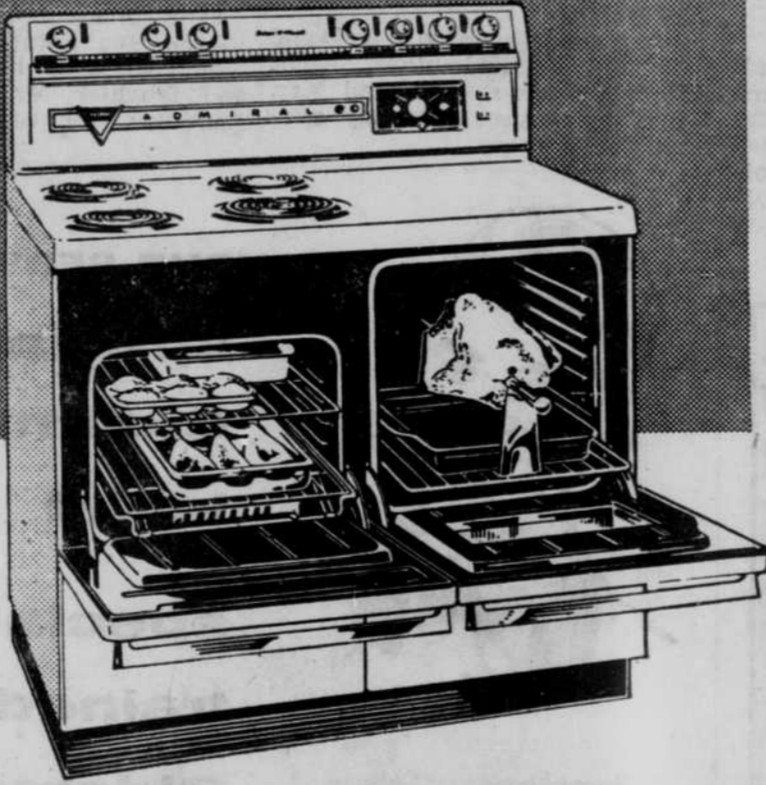
Imperial Model 6149