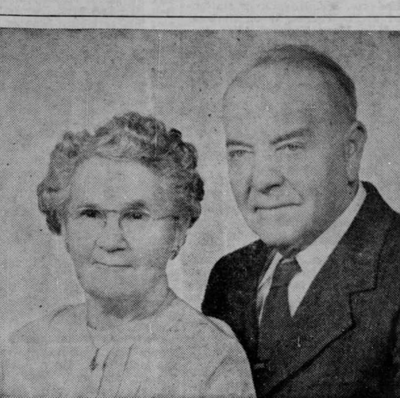
The Tushas . . . hold open house.

• Plan to be with us today for our regular weekly sale.