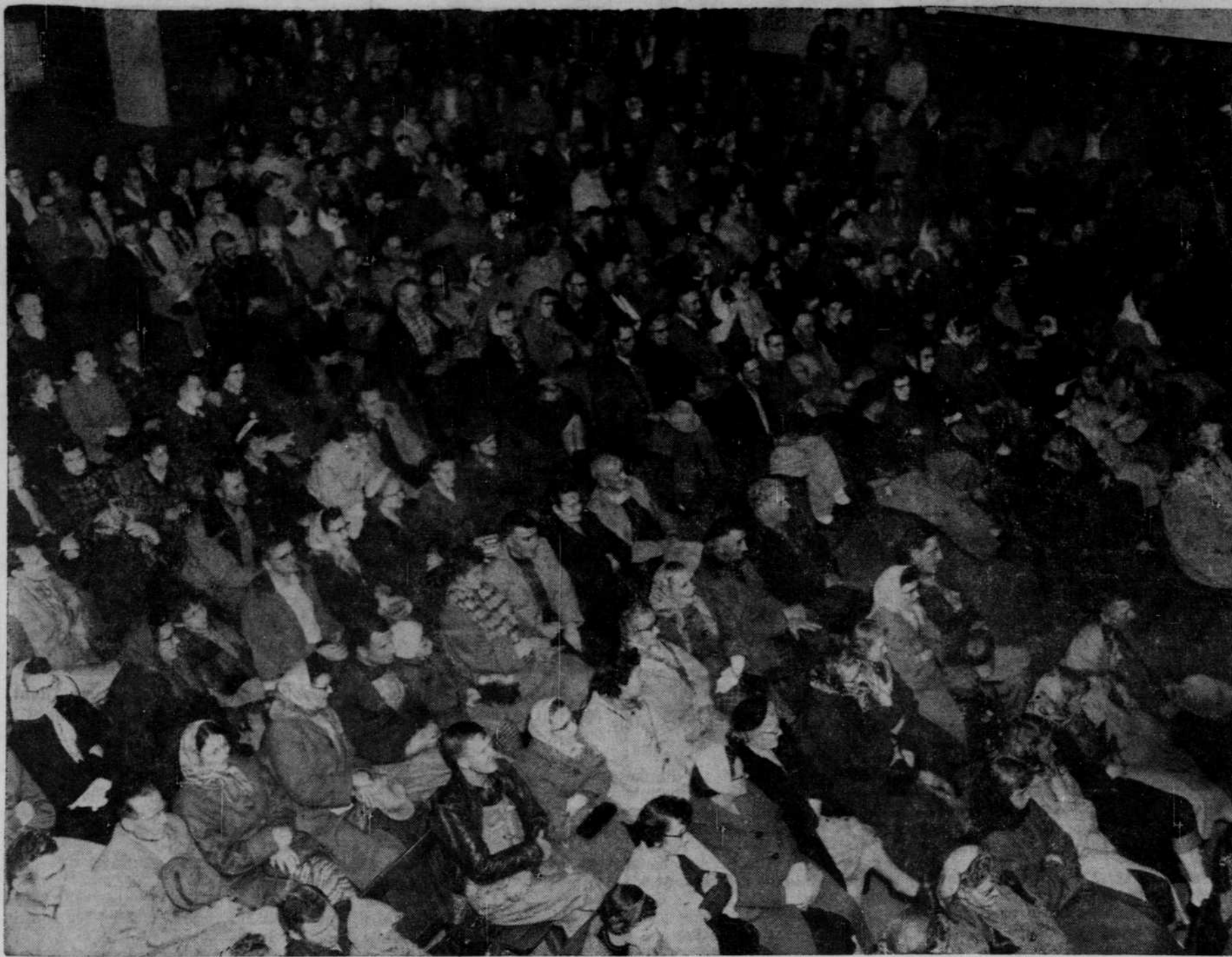
This is a portion of the crowd that filled the O'Neill public school auditorium late Saturday night for the bogus dollar auction, which was conducted by the retail trade committee of the Chamber of Commerce. Scores of items contributed by participating firms

were "sold" to highest bidders and the items were "purchased" with more than one hundred-thousand-dollars in bogus money. Bogus dollars were issued to purchasers last Thursday, Friday and Saturday.