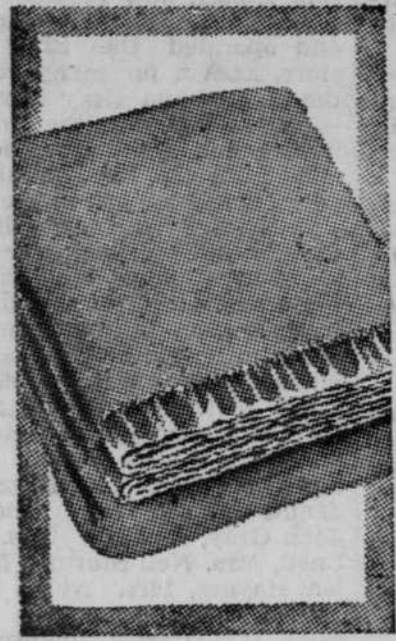
Color - Bright Rayon Nylon Blankets

—to match Penney's October - special bedspreads! They're extra-long 90 inch fleecy beauties, 3½ pounds, acetate satin bound... hand washable! A one-time buy!