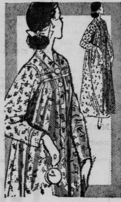
Stock up on Winter's Cotton Flanellette Nightgowns

at this low Penney price. Choose from many quaint floral patterns, all long-sleeved and cut straight for comfort... warm and soft-napped. Machine washable. Sizes 16 to 20.