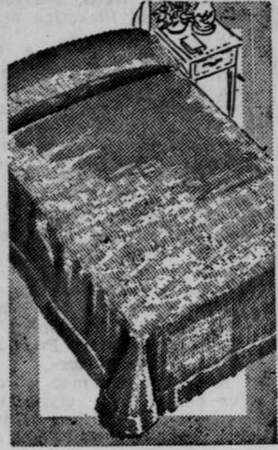
Special! Quality - Packed Bedspreads

Penney's best-selling chenilles in vibrant modern colors. Banded edges, rounded corners. Machine wash. No iron.