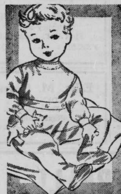
Imagine. Plastic-Soled Sleepers

... at a price so low. Snap them up at Penney's—warm, soft - napped cotton knits, with gripper fasteners for easy dressing, elastic back waist for snug fit. Pastels; sizes 1 to 4.