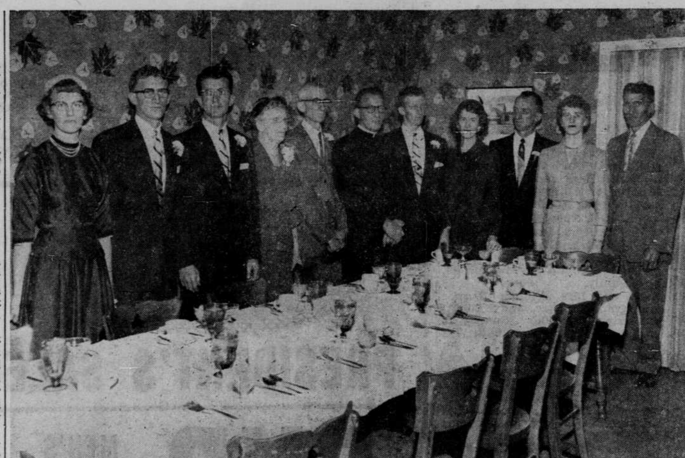
Hupp Family Reunites at Norfolk