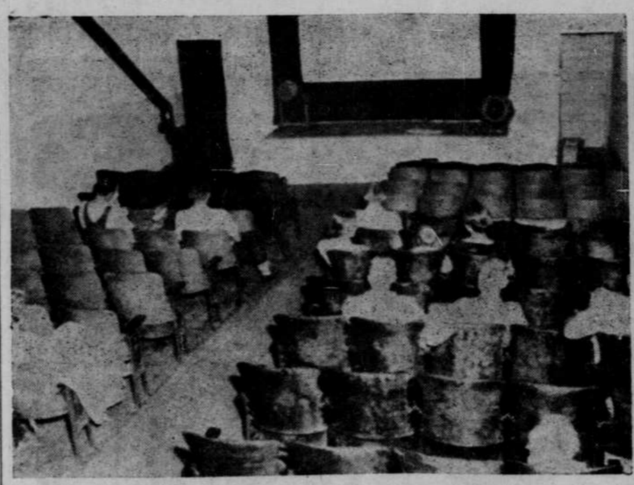
The Page Improvement club began operating the town's only theater after it had been closed down... young and old begin to file in for weekend show.