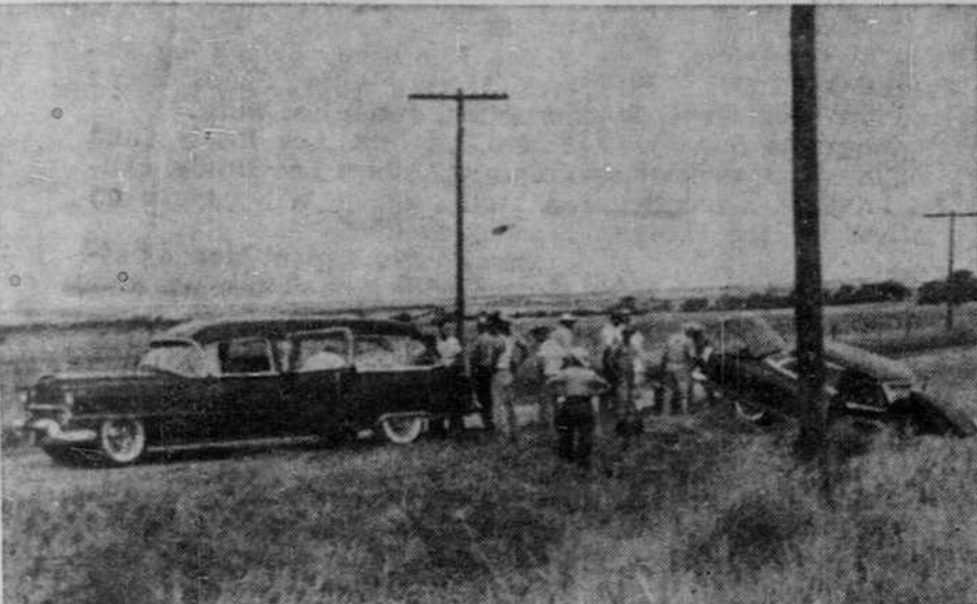
Mrs. Ernest Cofield, 70, had just been removed from the wreckage (right) and placed in an ambulance when this picture was taken.