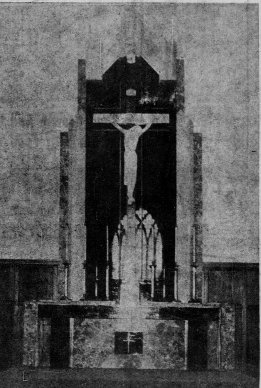
The closeup view of the sanctuary reveals the Italian rosara altar trimmed with Belgian black marble. (Note reflection of front window from opposite end of the church in the marble.)