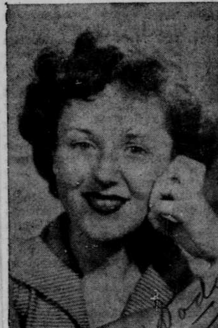
Plans Fall Wedding