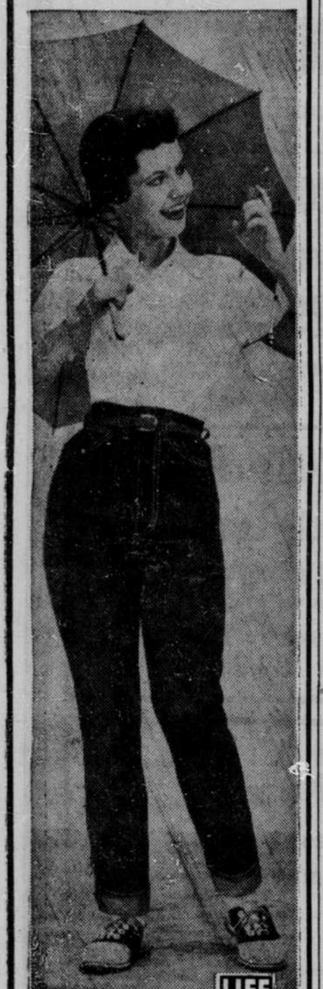
Lee Riders are the right jeans for wear anywhere. Sanforized to stay your size.