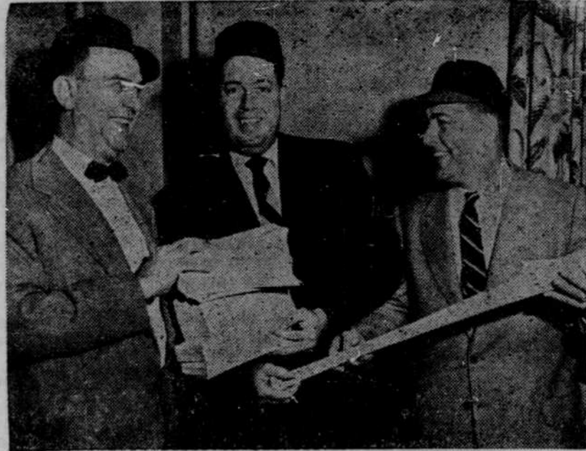
Omaha Cardinals Make Record Ticket Sale