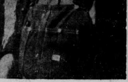
Recovers from Illness

Each whole orange has more health values than ever before realized... especially since scientists have pointed out the benefits of the citrus bioflavonoids found in the golden orange. These bioflavonoids work together with vitamin C to help you to better health, particularly in cases such as colds, other respiratory infections, childbirth, and surgery, where your tiny blood vessel walls need strengthening. There are up to ten times more of these citrus bioflavonoids in the whole peeled oranges than in the strained juice alone... that's why it is such a good idea to serve fresh oranges often.