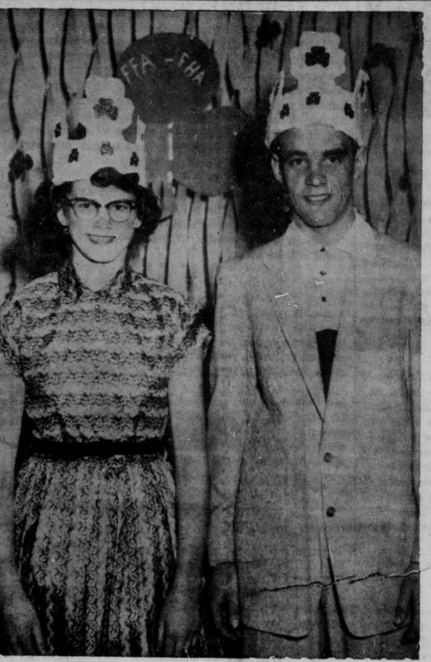
Reign at FFA, FHA Dance