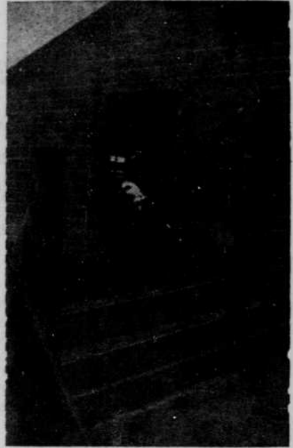
Muscovy hen . . . identity no longer a mystery.

haps, than the common barnyard duck, because of the coarseness of its feather, which are mostly black, shading into dark green in the wing feathers. They have a white head and may have a white spot here and there, elsewhere. The male of the species has a more pronounced topknot than the female and heavy orange-red wattles as well. The drake often dresses 10- to 12-pounds of rich meat that lacks the excessive greasy quality of other ducks. The hen rarely weighs more than four or 4½ pounds. The hens take to the air and may circle the buildings several times before they light again. This is their way of warming up in cold weather. The drake, being heavier, is not so active, though