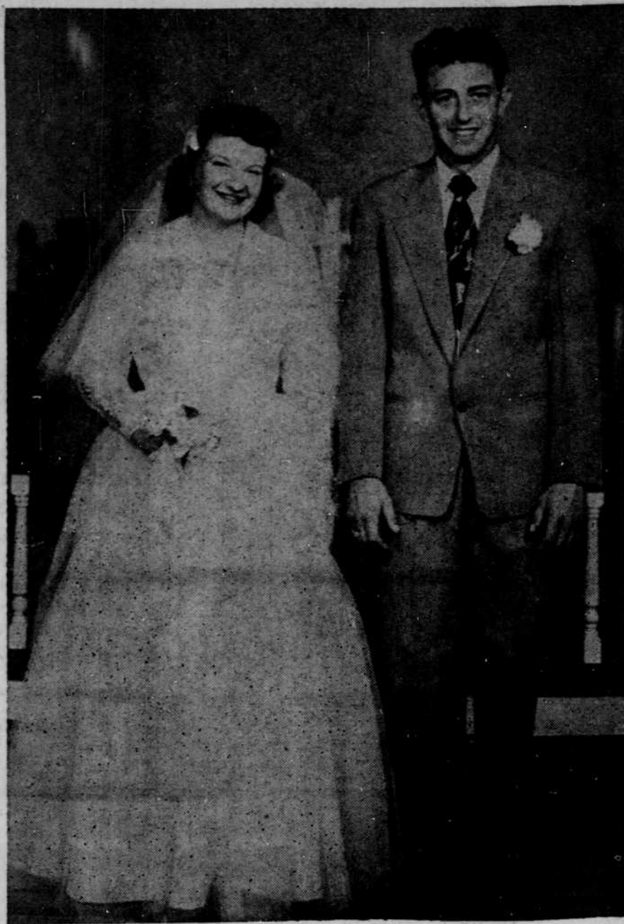
Wed in Saturday Eve Rite