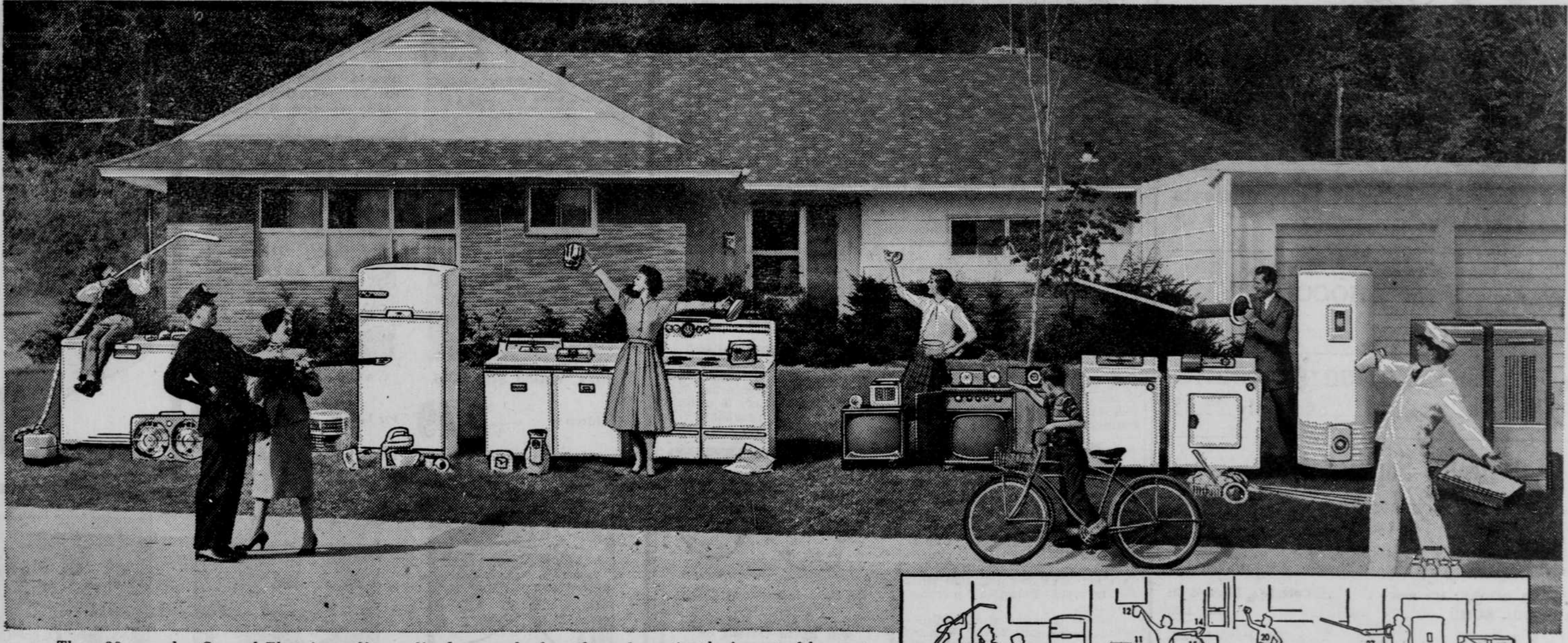
These 30 everyday General Electric appliances lined up on the front lawn dramatize the impact of low-cost electricity on American life. Per capita use of electricity in U.S. is 2 times Britain's, 5 times Russia's, 167 times India's.

An average U. S. family uses enough power each day to equal the energy output of 35 hard-working men