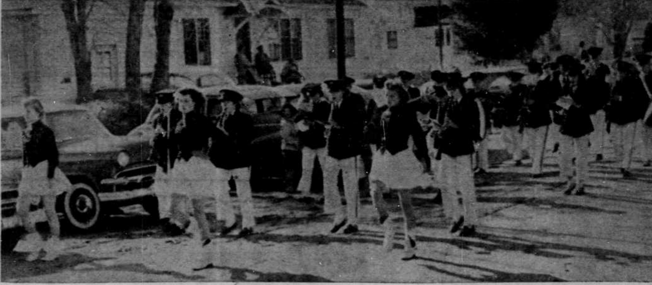
The Chambers public school band moves eastward down the main street at the head of the centennial parade, which was part of the veterans' day celebration there.