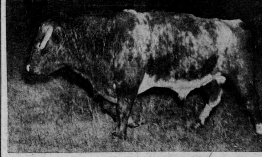
Ferdinand, 5-year-old purebred Shorthorn bull . . . invades registered Hereford heifer fold.

Since the purebred Herefords are the Van Horns' only means of livelihood, and since they have more at stake than the commercial cattle producer, they have been many years providing adequate fencing, yards and shelter, plus all the other precautions. They have built fences not only to keep their cattle in but to keep other stock out. Cattle guards afford easy entrance to the ranch