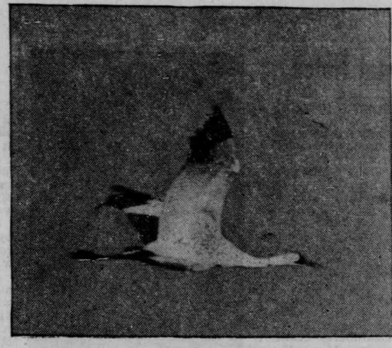
Whooping crane . . . distinguished visitor.