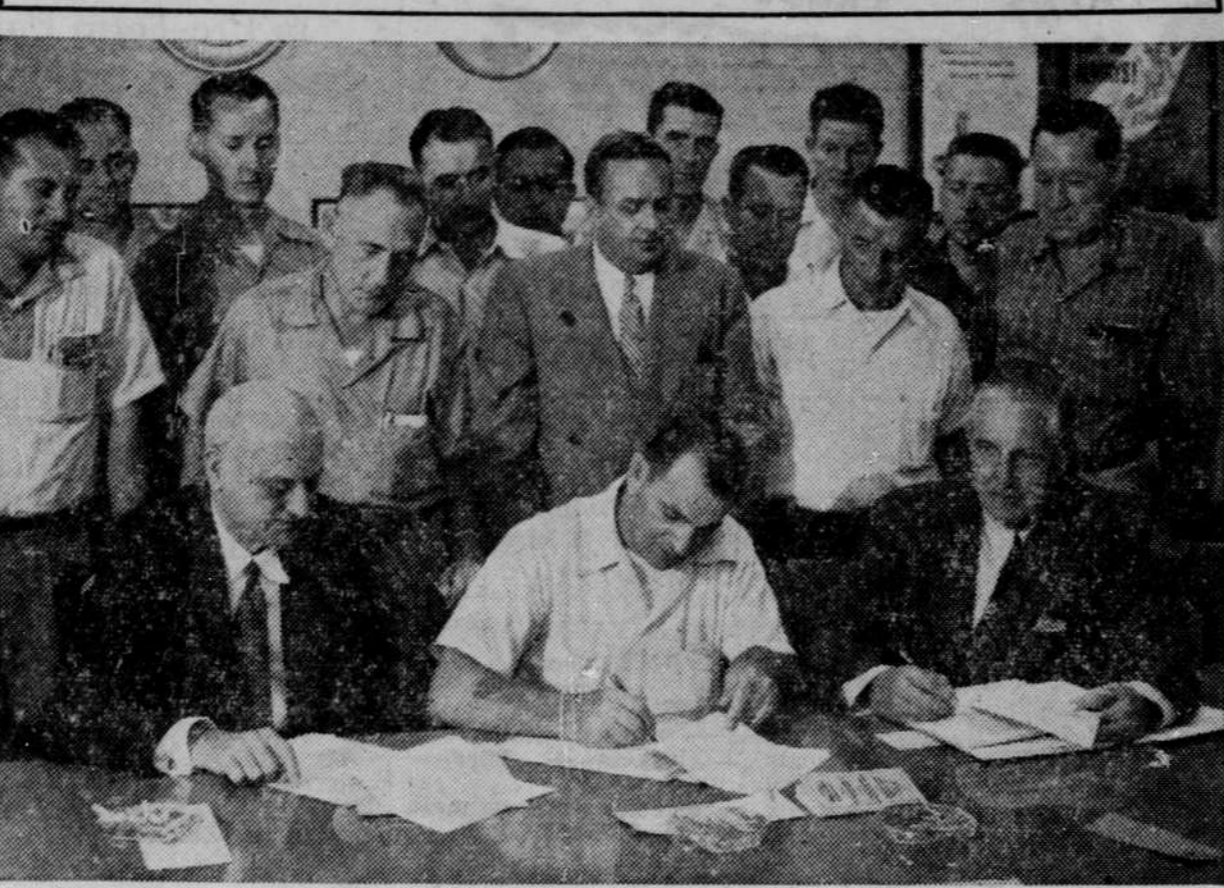
South Bend, Ind.—Signing of an agreement between The Studebaker Corporation and the bargaining committee of Local 5, UAW-CIO brought to a conclusion weeks of conferences between management and labor in which new and competitive wage rates were worked out for more than 10,000 Studebaker employees. The new rates, while somewhat lower, are still the highest paid in the industry. The company hailed the agreement as a "further demonstration of the teamwork between Studebaker workers and management that has existed for more than 102 years—a unique spirit of cooperation that has been in many ways Studebaker's greatest asset, resulting as it has in the superior craftsmanship and quality for which the company has been known." Shown signing the agreement, after it was ratified by an overwhelming majority of members of the local, are (seated, left to right) H. S. Vance, Studebaker president; Louis J. Horvath, president of Local 5; Paul G. Hoffman, chairman of the board of Studebaker. Behind Horvath is Paul M. Clark, vice president in charge of industrial relations. J. D. (Red) Hill, (behind Vance) international representative to Local 5, and Forest Hanna, (white shirt) vice president of Local 5, observe the signing of the agreement, along with members of the union's negotiating committee.