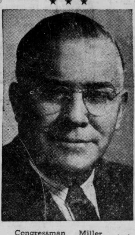
Congressman Miller... credit for HR 8520.