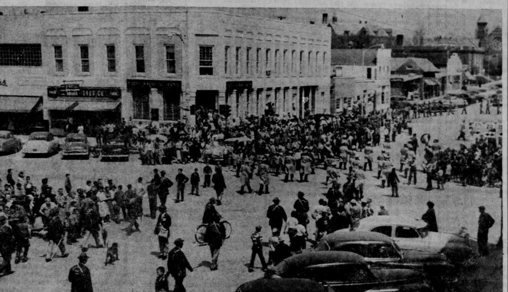
Muny Band, Colored Band Join in Making Music

CHAMBERS — The new Chambers park, started this spring, now has a fine planting of trees and shrubs, a well, and recently a fine new building was erected. Plans are underway for many additional improvements, such as a fireplace, tables, benches, etc.