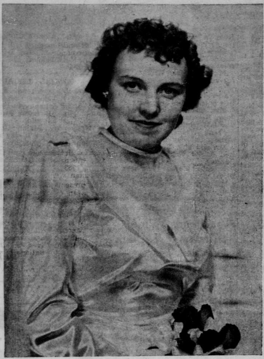
Weds at O'Neill