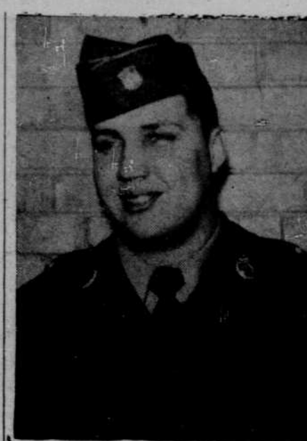
Bright . . . commuter. (Story at right)