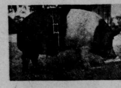
short course sponsored by the University of Nebraska's exten-

of his herd sires. This son of Marvel was first senior boar at the 1953 Iowa state fair and was paraded at the 1953 type conparaded at the 1953 type con-