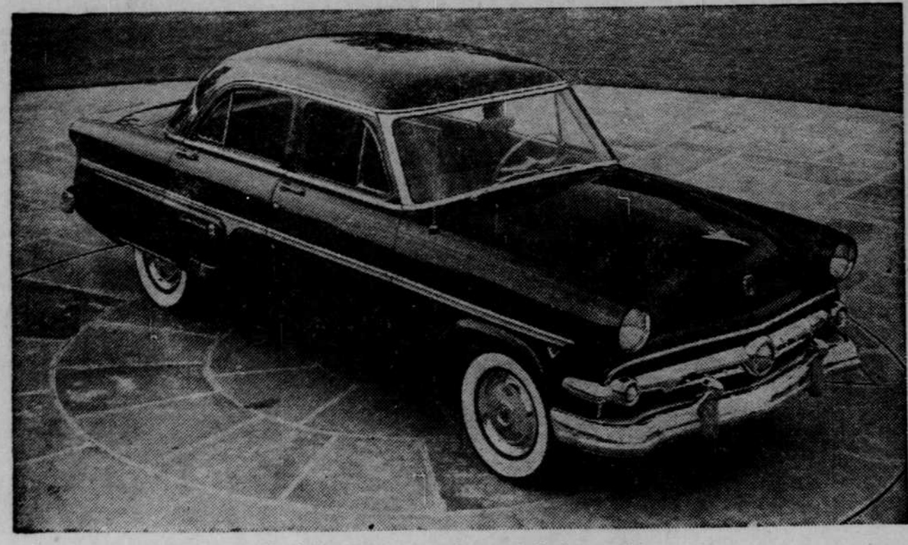
. . . advanced design engine.