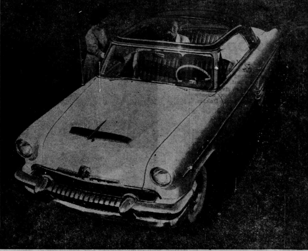
Mercury's Monterey "Sun Valley" . . . new body styling.