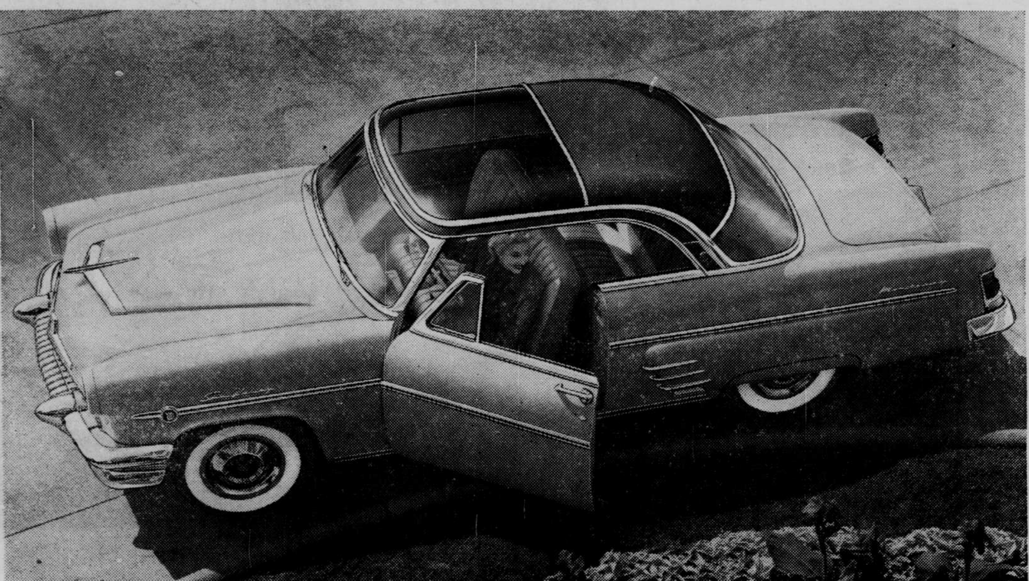
EXCLUSIVE SUN VALLEY FABRICS AND COLORS-Stunning combinations of soft vinyls and fabrics, and optional leathers . . . in ivory or yellow and turquoise.

You get a new, specially designed interior found on no other car-plus Mercury's all-new 161-horsepower engine, and your choice of optional, work-saving features.