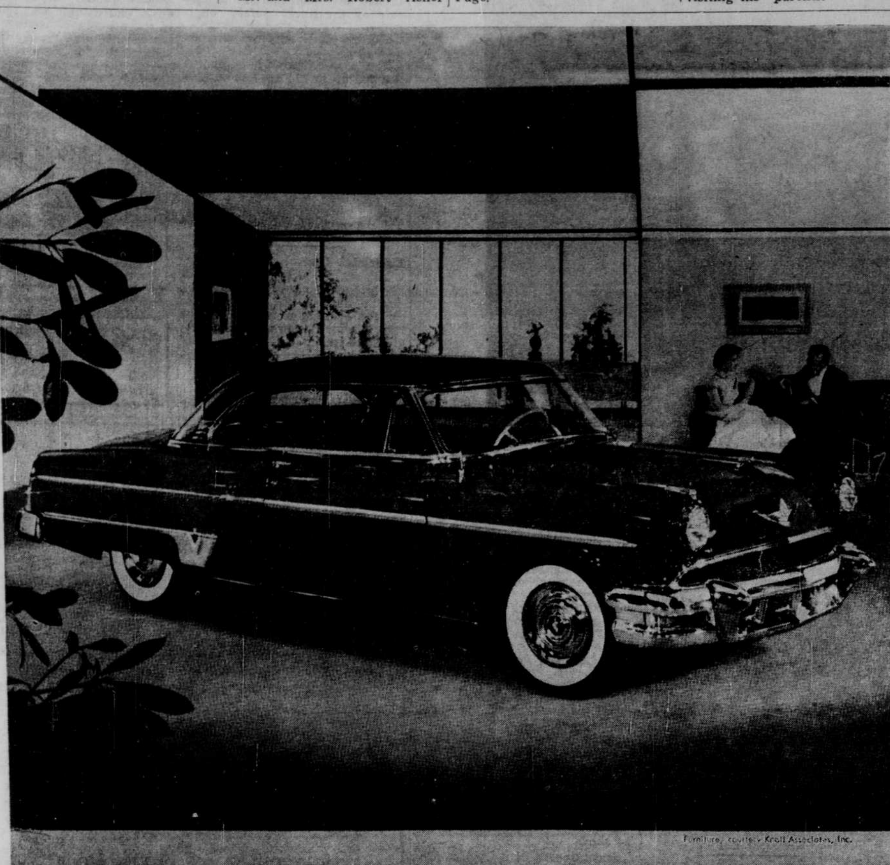
What started the big move to the new Lincoln?