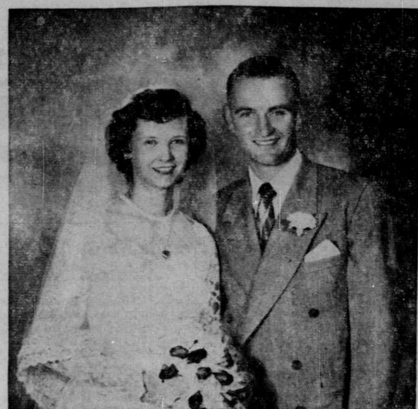
Wed in Church Rite