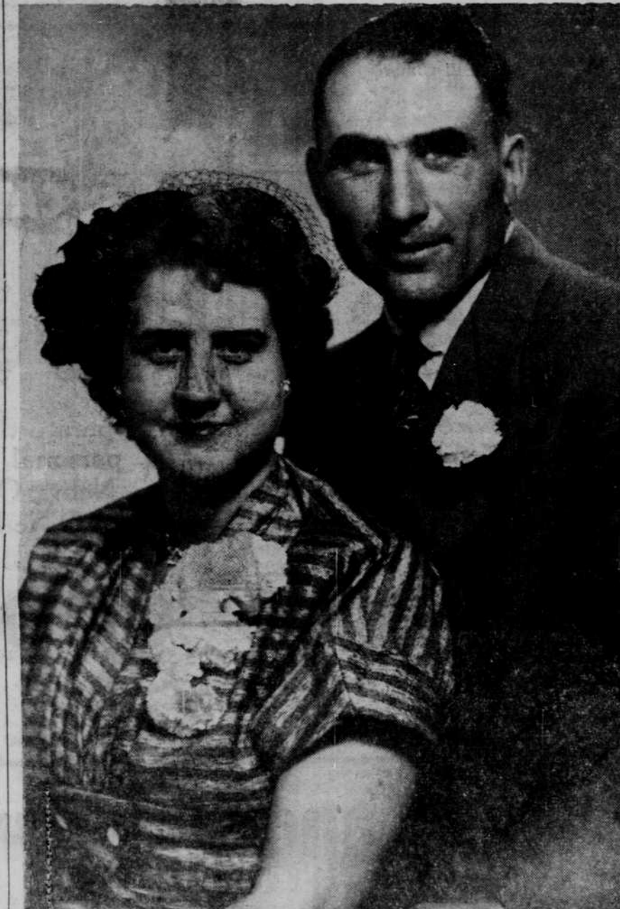
Wed at Spencer

Reports are that some western | Phone us your news - 51.