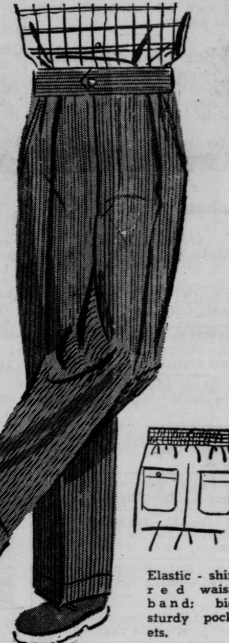
Elastic-shirred waistband; big, sturdy pockets.

These long-wearing pinwale corduroy slacks are handsome and sturdy. The back of the waist band is elastic shirred for snug, comfortable fit. They're smartly designed, action - built for long wear, have zipper fly. Boys' sizes 4 to 16 in rich rust, grey, brown, navy, wine and green. Start enjoying yours today. Thrift-priced.