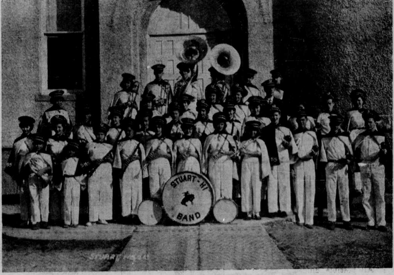
Stuart high school band . . . to play Friday, September 4.