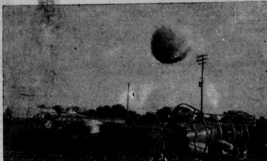
Rubber-bumpered jalopies . . . in rough-and-tumble pursuit of a big rubber ball.

"We had been searching for several months for some type of entertainment that might replace the rodeo this year. We came upon this new, novel pushball game," Wink concluded.