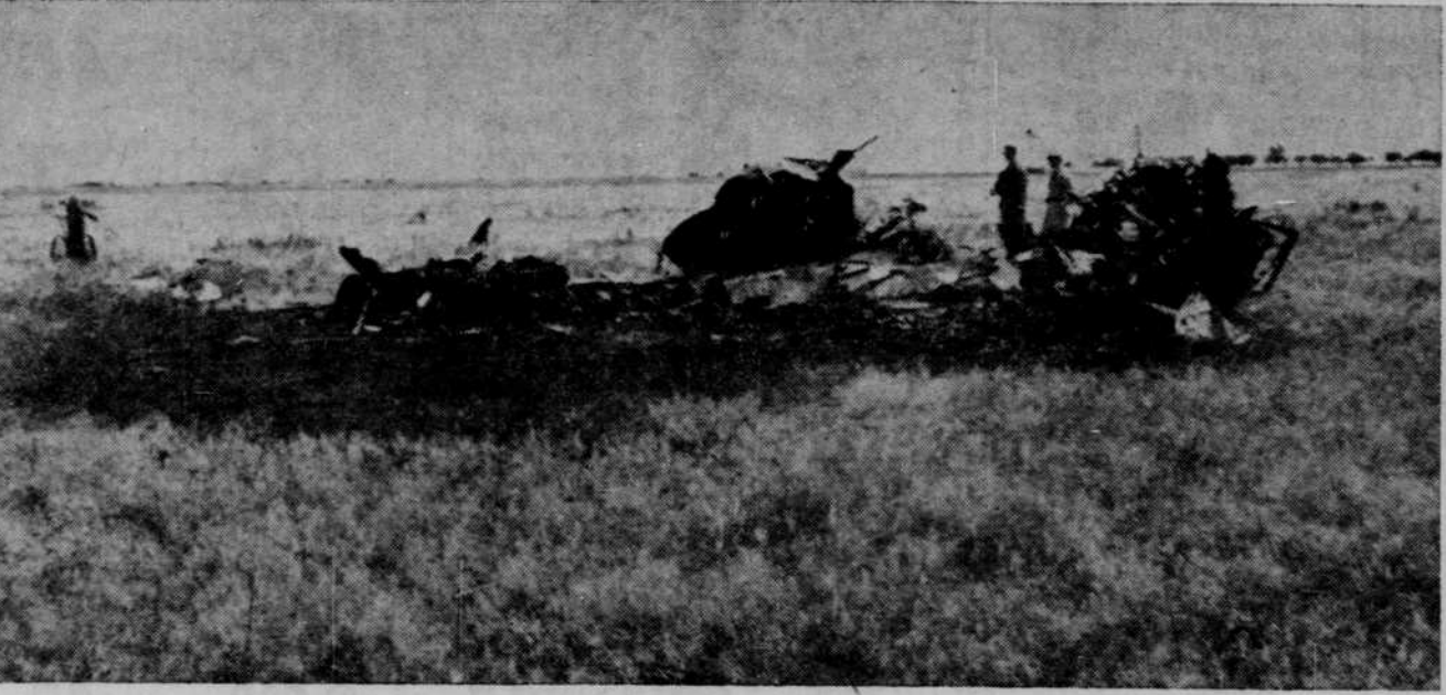
General closeup view of 'copter wreckage.