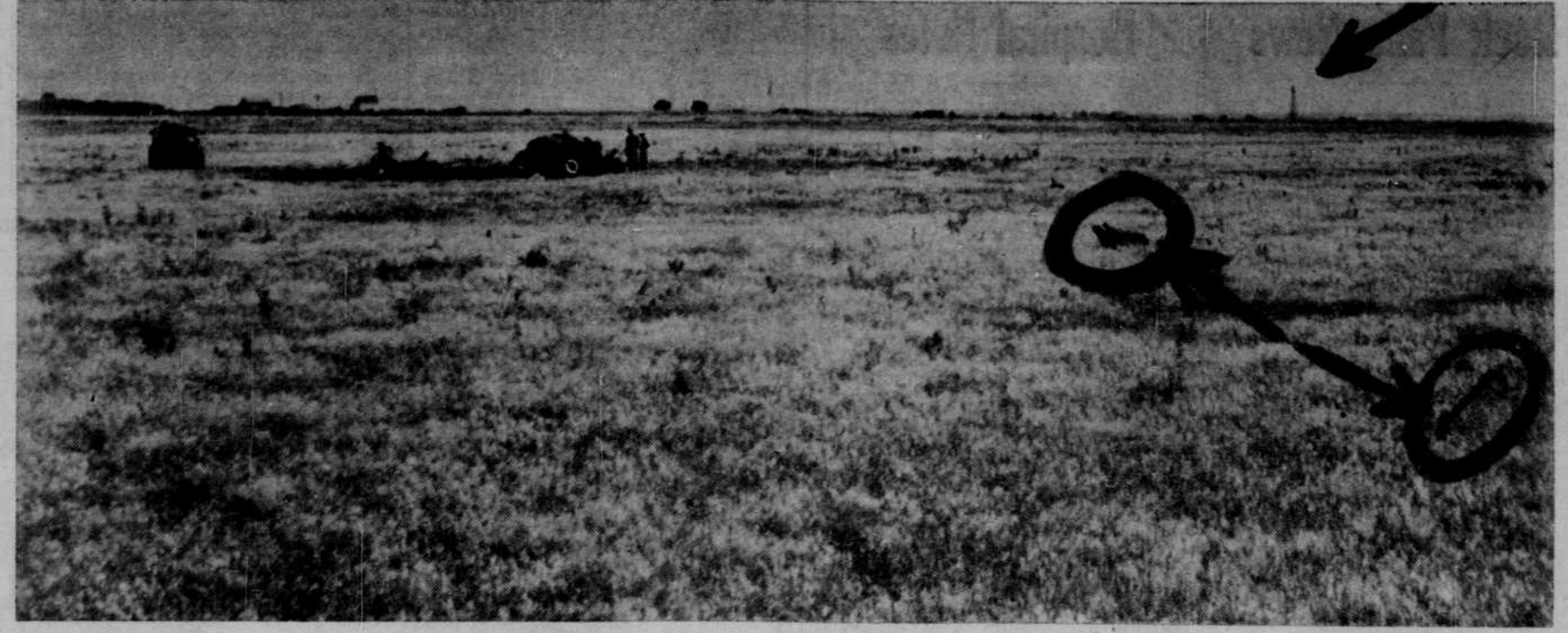
'Copter wreckage was strewn over one hundred yard radius. (Arrow points to wind tower on test site in background a half-mile away.)

household goods at public auction at the residence located