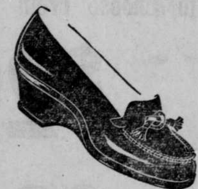
As Illustrated Tan, Beige