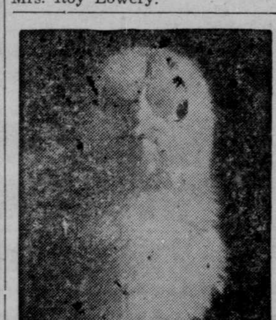
"I don't have to worry about coccidiosis!"