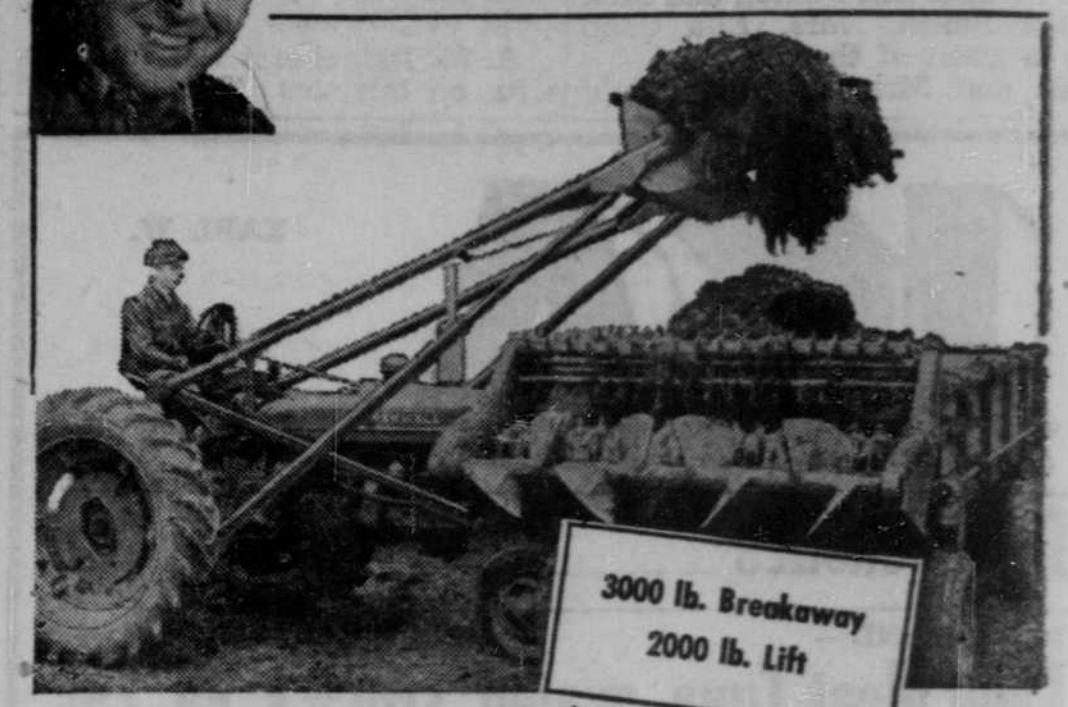
3000 lb. Breakaway 2000 lb. Lift

THERE'S BRUTE STRENGTH and power in every inch of this big new Farmhand—an amazing, built-in ruggedness that makes quick, easy work of all your lifting, loading and moving jobs. Low, compact frame goes anywhere your tractor can go. 12 ft. full-reach lift lets you load any vehicle from one side. Heavy-duty construction permits fast wheeling and turning with big loads. Buckets capacity with detachable gravel plate—14 cu. ft., with detachable All-Purpose Scoop—22 cu. ft. Fits all popular 2-3-4 plow RC Tractors.