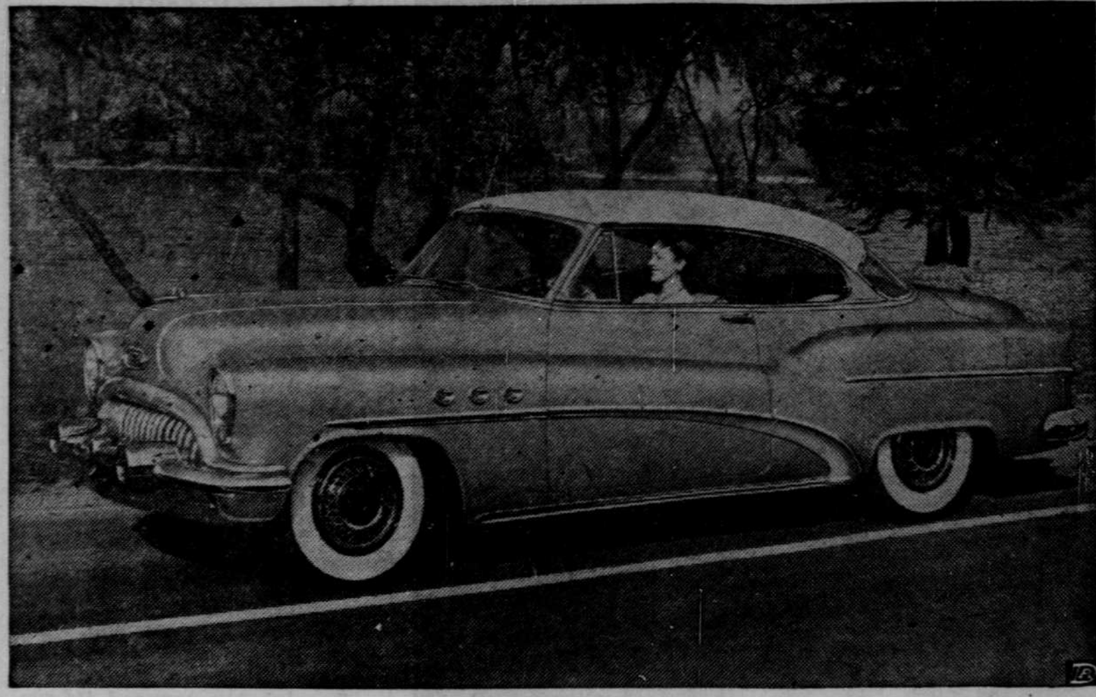
1953 Buick . . . new power, performance, styling.