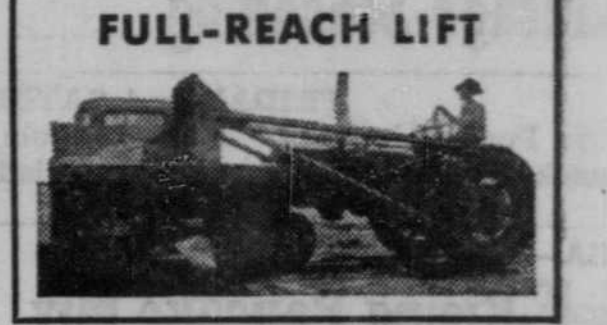
At 8 ft. lift the bucket is directly above its ground-level position.

THERE'S BRUTE STRENGTH and power in every inch of this big new Farmhand—an amazing, built-in ruggedness that makes quick, easy work of all your lifting, loading and moving jobs. Low, compact frame goes anywhere your tractor can go. 12 ft. full-reach lift lets you load any vehicle from one side. Heavy-duty construction permits fast wheeling and turning with big loads. Buckets capacity with detachable gravel plate—14 cu. ft., with detachable All-Purpose Scoop—22 cu. ft. Fits all popular 2-3-4 plow RC Tractors.