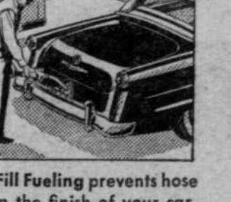
Center-Fill Fueling prevents hose marks on the finish of your car. No gas spill on fenders. Short