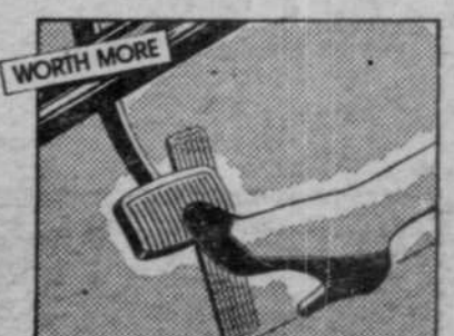
Power-Pivot Pedals, suspended