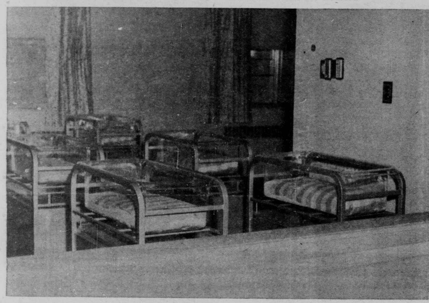
Doting new fathers will peer through this window into the nursery located at the west end of the second floor. Capacity is 12 bassinets. Each bassinet is a unit in itself with drawer space for